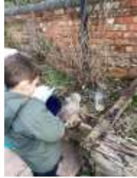
In science we prepared rain gauges so we can measure rain water collected from the school playground.