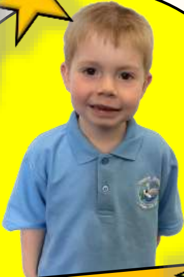
Class 1 STAR OF THE WEEK

Well done to all the children that received an award this week.