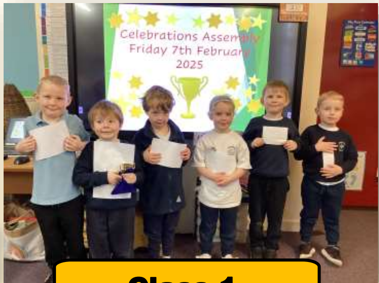
Class 1 Stars