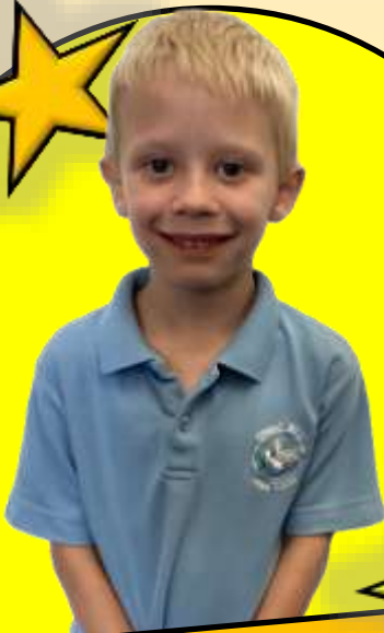
Class 2 STAR OF THE WEEK