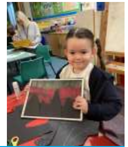
We finished our Northern Lights chalk and collage art.