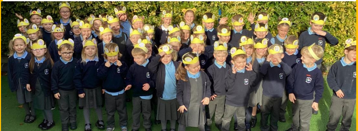
CHILDREN IN NEED DAY