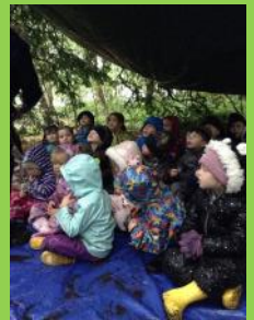
I loved digging, splashing and climbing on the ropes..