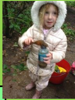
Digging was fun!