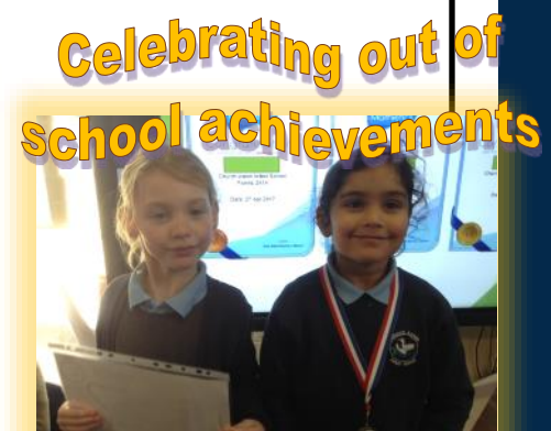
Celebrating out of school achievements Congratulations on your sporting achievements