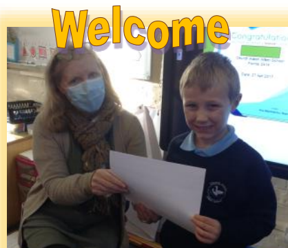
Welcome A warm welcome to our new Year 1 child.