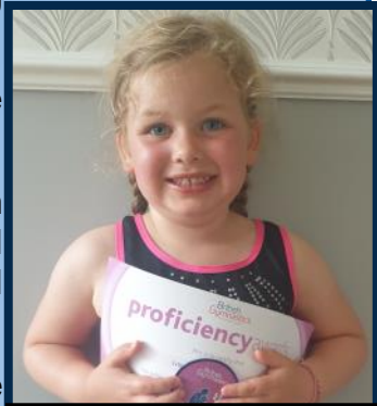
Well done with your Gymnastics award.

In RE the children have also been thinking about questions about the world.