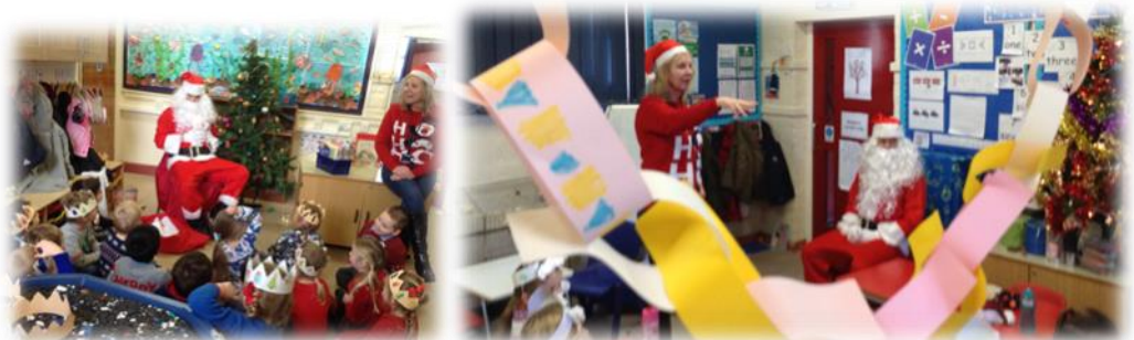
Children in both classes enjoyed the visit from our special visitor.