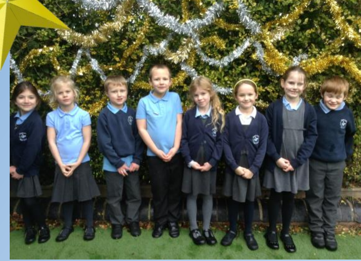
The Narrators have been practising their readings for the school play.