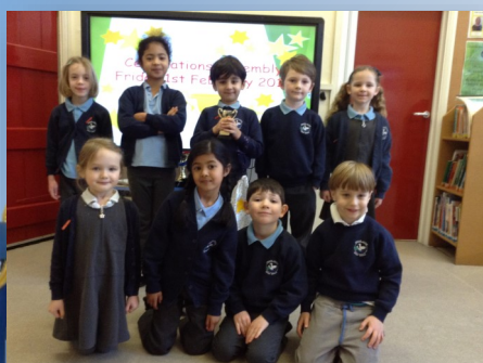
The winning team is blue for this week!

Congratulations to all the children that have received an award this week.