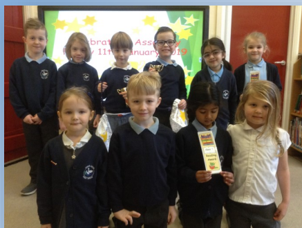
The winning team is GREEN

Congratulations to all the children that have received an award this week.